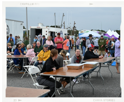
FOOD TRUCK VENDORS