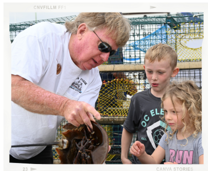
KIDS ACTIVITIES AND TOUCH TANK