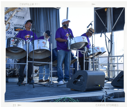
LIVE BAND PERFORMANCES