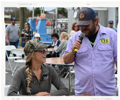
CRAB CAKE EATING CONTEST