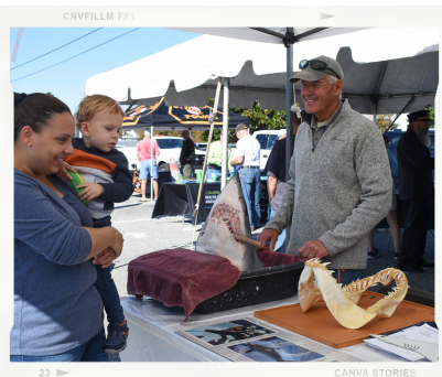
EDUCATION AND MARITIME HERITAGE